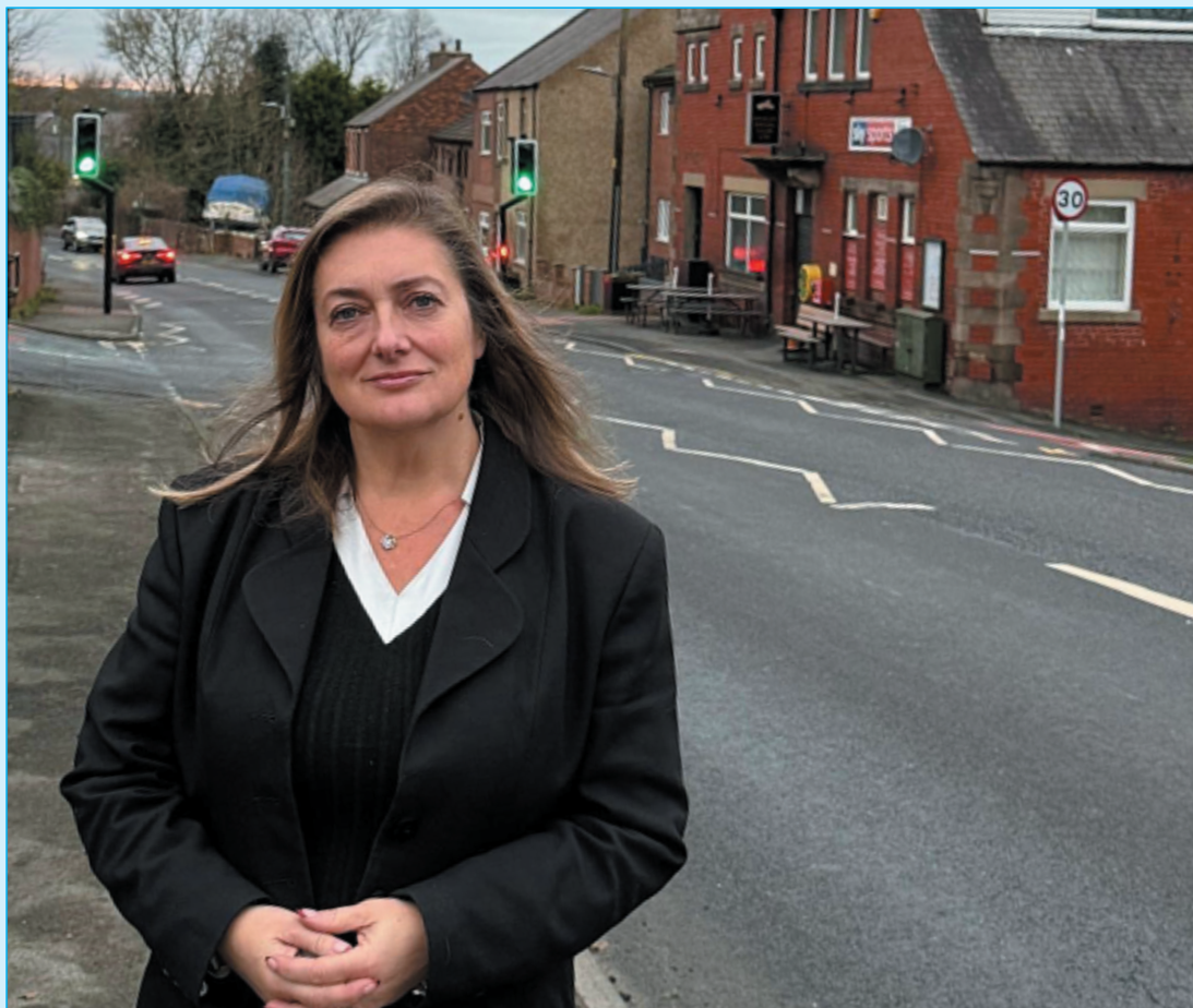
Some roads and pavements in Prudhoe are in a poor state