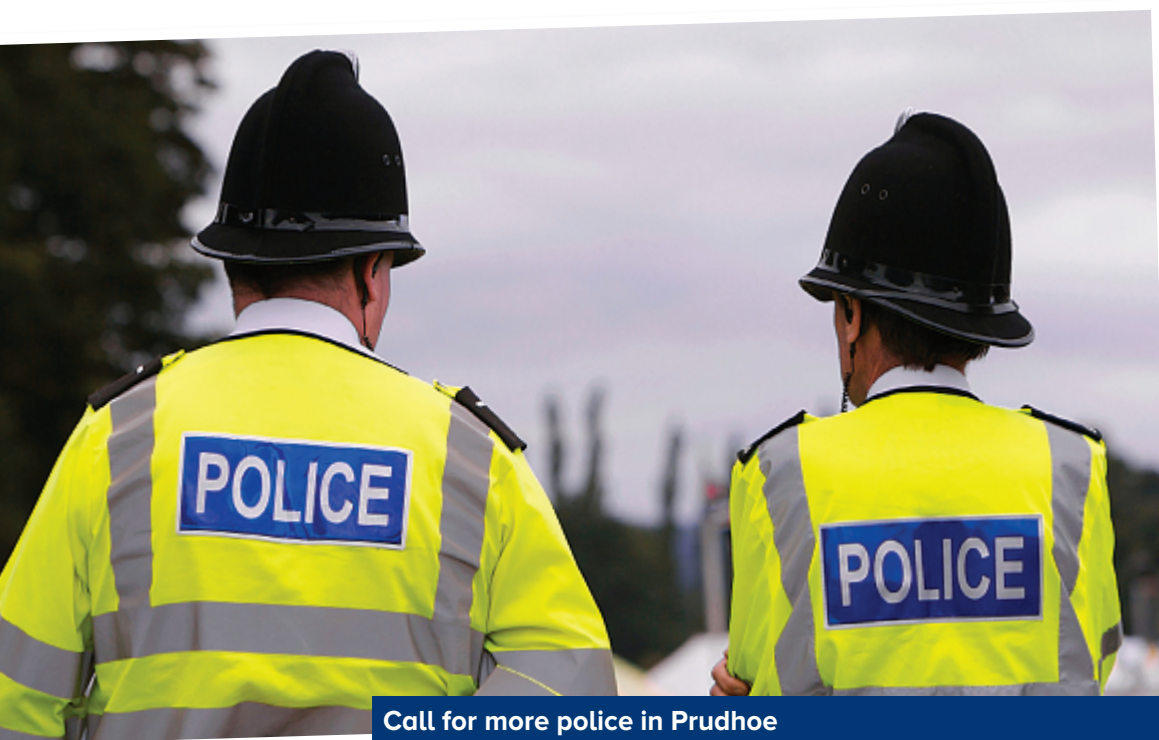
Call for more police in Prudhoe