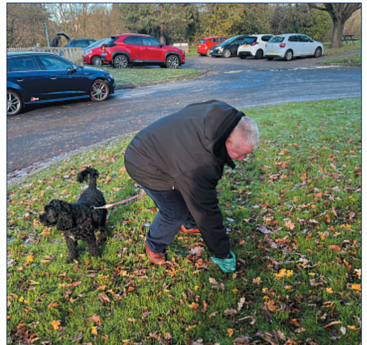
Pick up and bin dog mess